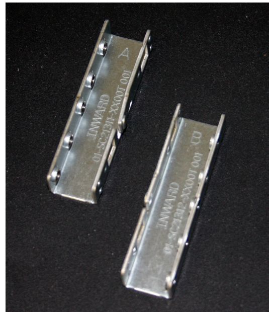
Brackets A and B